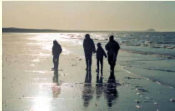
North Beach, Naikoon Provincial Park (D.K. Harris)

27 Haines Road - Travelers use this road to cross the very northwest corner of BC between Haines Junction in the Yukon and Haines in Alaska. Much of the road traverses alpine tundra, which aids in sighting wildlife. Dall Sheep and Golden Eagles may be seen in the Blanchard Creek area just south of the BC/Yukon border. Willow, Rock and White-tailed Ptarmigan are all found here as well as numerous other bird species including Gyrfalcon and Snow Buntings. Grizzly Bear may be seen from spring through fall, while Moose are more often seen during the summer months.