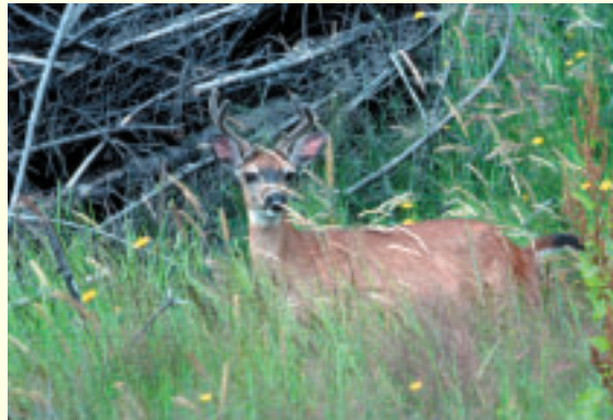
Sitka Deer, Queen Charlotte Islands (D. Horwood)