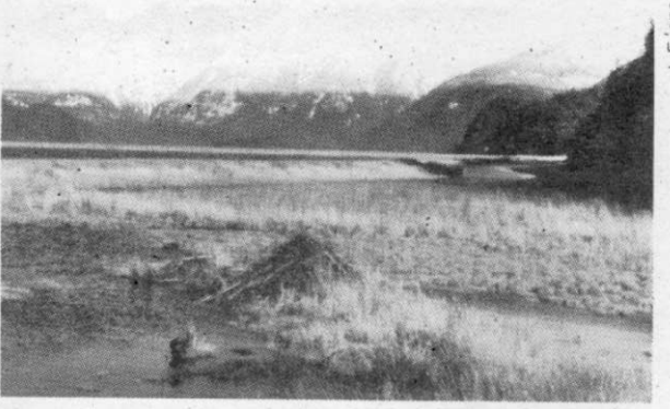
Beaver lodge along the Katzie Slough dyke