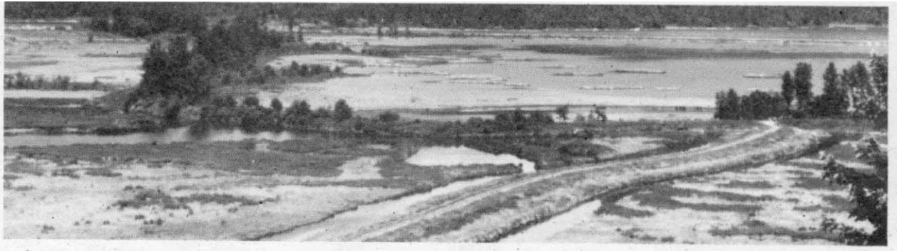
View from the middle hillside pavilion of the Pitt Unit marshes and the Nature Dyke.