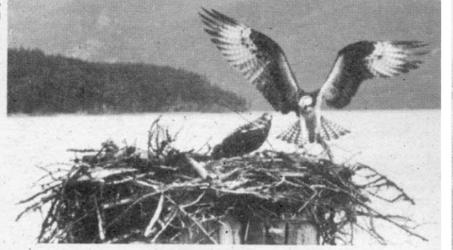
Osprey nesting on the Pitt River.

<u>Bittern and Rails</u> - American Bittern, Virginia Rail and Sora are easily heard throughout the marshes, especially in the spring and summer months.